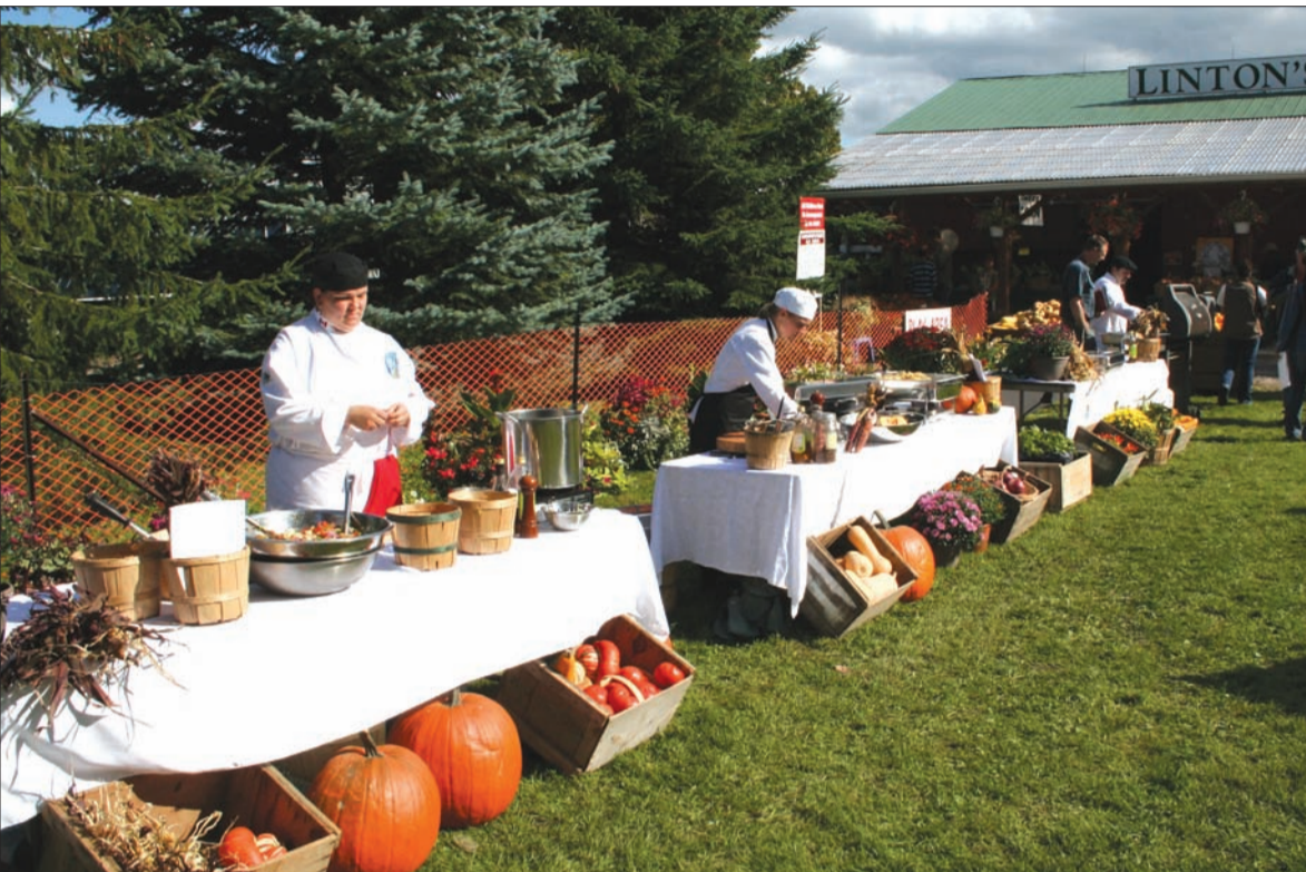
This year, the DAAC Tour highlighted five farms in the City of Oshawa. Each location provided an enthusiastic first-hand look at their farm.

The Durham Agricultural Advisory Committee (DAAC) hosted its sixth annual Durham Regional Farm Tour, Deep Roots (featuring the City of Oshawa) on Sept. 16. The tour highlighted five farms, including